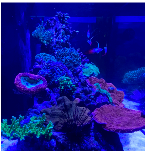
△ Our beautiful saltwater set up

We have continued to have new livestock in to ensure there is something for everybody and we are expecting more shipments to arrive in the coming weeks with Christmas just around the corner.